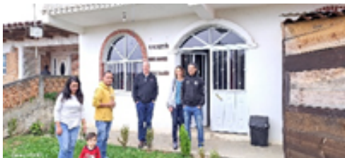
Front of building