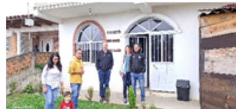
Front of building